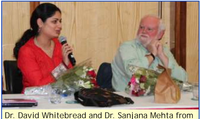
CUTS, U.K. expressing their views on Mulyavardhan.

Cambridge University Technical Services (CUTS) Team visits BJS Mulyavardhan project