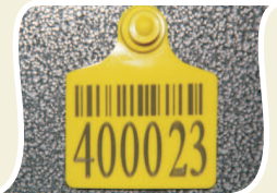
-Insurance Cover -Fire Insurance

COMPUTERISED DIGITAL RECORD KEEPING and data CONNECTED TO GOVERNMENT PORTAL