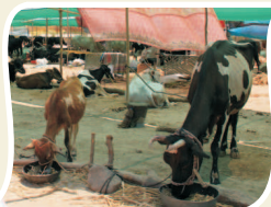
20-50 GM Mineral Mixture Per Animal