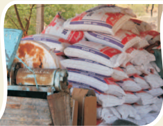
1 KG of 'Cattle Feed' Per Animal