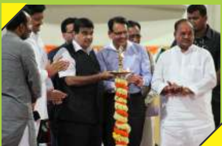
Inauguration of the National Convention by Shri Nitinji Gakari, Honorable Minister of Road Transport and Highways.