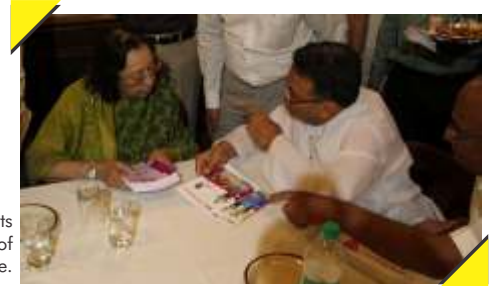
Bharatiya Jain Sangathan and its Minority experts had the privilege to interact with Union Minister of Minority Affairs Dr. Najma Heptulla at Pune.