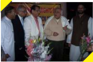
The Jain community celebrates the minority status accorded by the Union government on 27th January, 2014.

In this year-end-look-back, we bring to you the Newsmakers - from the Minority Status granted to the Jain Community to the National Convention 2014 - that made an impact in the community and beyond!