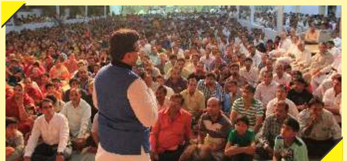
A record gathering of over 3000 people at Hyderabad listening in rapt attention to Shri. Parakh's address at the Parivartan Yatra - Nayi Peedhi, Nayi Soch - Phase III!