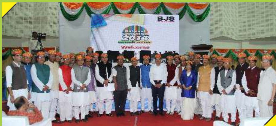
The newly selected National Council Members at the National Convention.