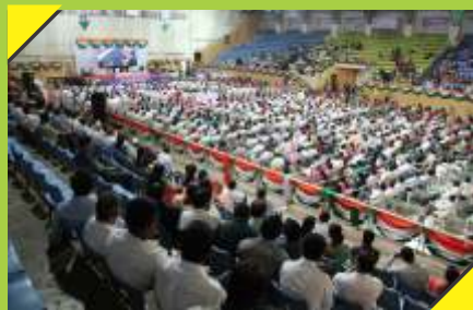
A gathering of over 2000 people from the Jain community in the BJS National Convention at Pune.