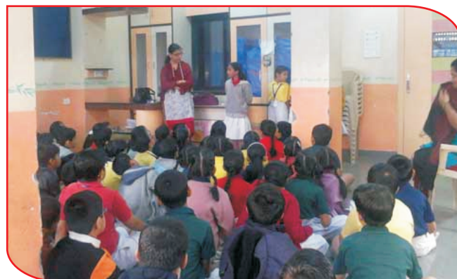
Baal Sabha at IBH Bhatia School, Mumbai