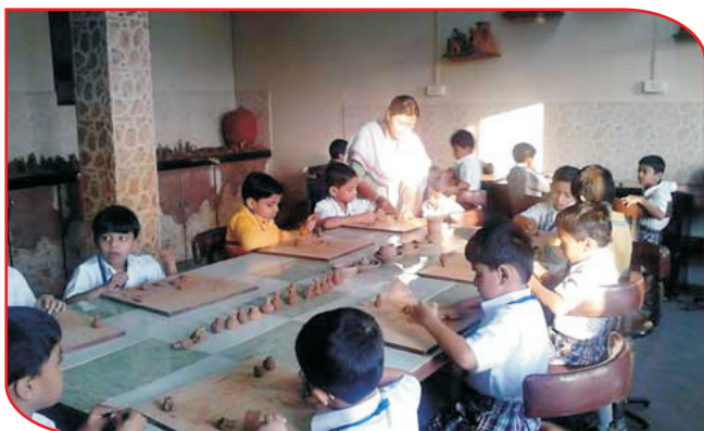
Pottery making class at Swadhyay Bhavan, Mumbai

Our next line up comprises the assessment and accreditation of two CBSE schools of Mr. Kapil Sibal's constituency in North Delhi from 21st to 24th Jan, 2013 using the BJS SAA model and also a report sharing presentation of Hiralal Jain School, Delhi which was assessed in Oct'12. From February we begin with the report sharing for the eight schools of Meghalaya as assessed in Oct'12.